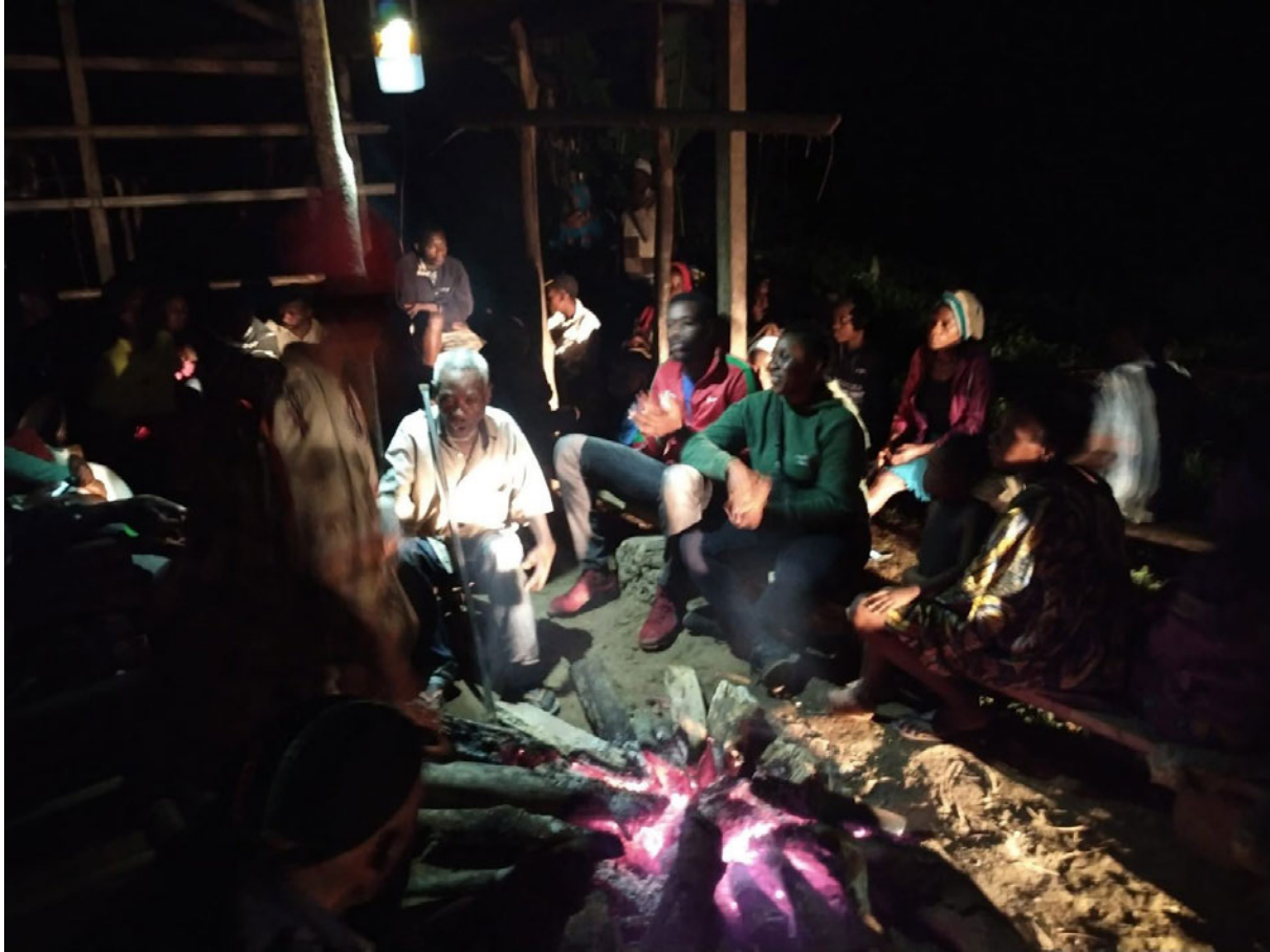
Fig. 2. One the village elders from Doum recounting traditional stories and legends about hunting by the Baka. The Darwin team recorded these tales to inform our knowledge and understanding of hunting practices in our study communities.

able to use funds that had been earmarked for this activity to be reallocated for later in 2021, if travel and the COVID situation has improved in Cameroon.